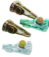
156T1978A Extra/replacement trippers 1 ON and 2 OFF