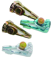
156T1978A Extra/replacement trippers 1 ON and 2 Skipper Screws (3 per package) OFF