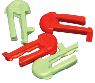
156PB10398A Trippers - Clip, ON/OFF, 24 Hour for PB and PF1100 Series