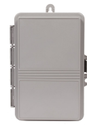
E200 Case-Outdoor, Type 3R Plastic, Gray