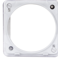
FM-FU FM1 Flush Mount Housing Kit