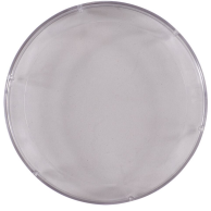
DC-FME-A Clear Dust Cover for Electronic Panel Mount Timers