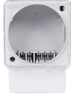
FM-SU FM1 Surface/DIN Rail Kit