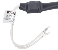
ET-NF RC Snubber Noise Filter 24-277 VAC for Electronic Controls