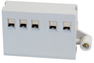
017900022 Installation Base, TCC Series