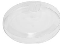
017600546 Glass, Clear, TSM1 Series