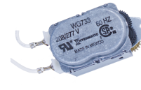
WG733-14D 208-277 VAC, 60 Hz Motor for R8800, T1900, T1970, and T8800 Series