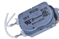
WG730-14DMX 125 VAC, 60 Hz Motor for R8800, T1900, T1970, and T8800 Series