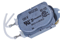
WG730-14D 125 VAC, 60 Hz Motor for R8800, T1900, T1970, and T8800 Series