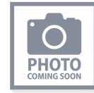
156T3225A Trippers (2) Sets (ON/OFF) for T7000, WH Series (With ON/OFF Markings)