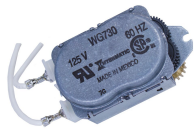
WG730-14DMX 125 VAC, 60 Hz Motor for R8800, T1900, T1970, and T8800 Series