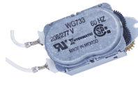
WG733-14D 208-277 VAC, 60 Hz Motor for R8800, T1900, T1970, and T8800 Series