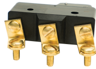
133T701A Replacement Snap Switch for T1900 and T2000 Series