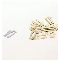
156T1950A Set of 12 Trippers for T1900, T2000, C8800, R8800 and T8800 Series