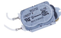
WG733-14DMX 208-277 VAC, 60 Hz Motor for R8800, T1900, T1970, and T8800 Series