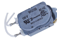
WG730-14DMX 125 VAC, 60 Hz Motor for R8800, T1900, T1970, and T8800 Series