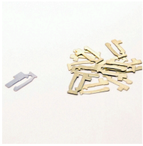
156T1950A Set of 12 Trippers for T1900, T2000, C8800, R8800 and T8800 Series