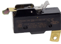
133T700A Micro Switch for T8800 and R8800 Series