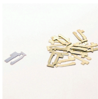
156T1950A Set of 12 Trippers for T1900, T2000, C8800, R8800 and T8800 Series