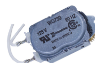
WG730-14DMX 125 VAC, 60 Hz Motor for R8800, T1900, T1970, and T8800 Series