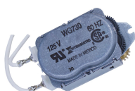
WG730-14D 125 VAC, 60 Hz Motor for R8800, T1900, T1970, and T8800 Series