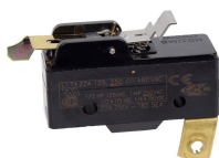
133T700A Micro Switch for T8800 and R8800 Series