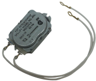
WG1573-10DMX 208-277 VAC, 60 Hz Motor for T102, T104, T106, T172, T174, WH40