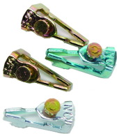
156T1978A Extra/replacement trippers 1 ON and 2 OFF