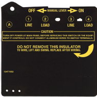
124T1952 Insulator for Double-Pole Time Switch (T103, T104, T105, T173, T174, T175, T176, T185, WH40)