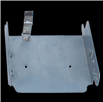
22T338GR Mounting Bracket for Intermatic Standardized Timer Mechanisms