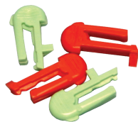
156PB10398A Trippers - Clip, ON/OFF, 24 Hour for PB and PF1100 Series