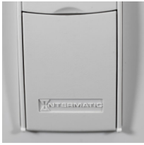
6ST3058 ST01 White Replacement Door