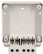
017800022 Base, 1-Channel, TCC Series