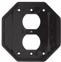
WP101 Double-Gang Duplex Insert