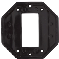
WP102 Double-Gang GFCI Insert