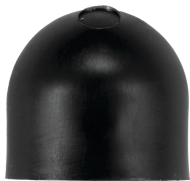
6LV1352 Light Shield Accessory for EK4036S, EK4436SM, K4000 Series Button Photocontrols