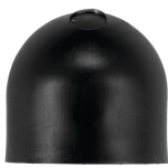
6LV1352 Light Shield Accessory for EK4036S, EK4436SM, K4000 Series Button Photocontrols