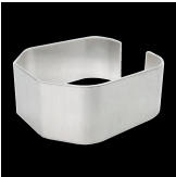
22LG0120 Light Guard Accessory for EK4000 Series Electronic Fix Mount Photocontrols