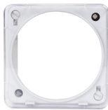
FM-FU FM1 Flush Mount Housing Kit