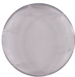
DC-FME-A Clear Dust Cover for Electronic Panel Mount Timers