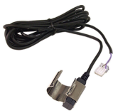
178PA28A Freeze Probe Kit, 10k OHM, For MultiWave systems