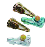
156T1978A Extra/replacement trippers 1 ON and 1 OFF