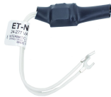
ET-NF RC Snubber Noise Filter 24-277 VAC for Electronic Controls