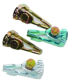
156T1978A Extra/replacement trippers 1 ON and 1 OFF