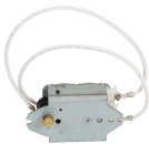
WG433-20D MOTOR-BOXED, 208/277V 60HZ