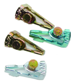
156T1978AMX 1 Set of ON/OFF Trippers for T100, T7000, and WH40 Extra/replacement trippers 1 ON and 1 OFF