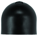
6LV1352 Light Shield Accessory for EK4036S, EK4436SM, K4000 Series Button Photocontrols