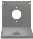
MP5GYS3S 30 A, 1-9/16" Mounting Plate, Gray