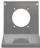
MP5GYS56L 50/60 A, Mounting Plate, Gray