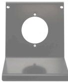
MP5GYS3L 30 A, 2-1/8" Mounting Plate, Gray