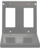
MP5GYD 20 A, Double-Gang Mounting Plate, Gray